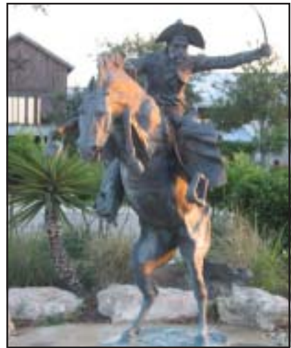
The Golf Club of Texas.