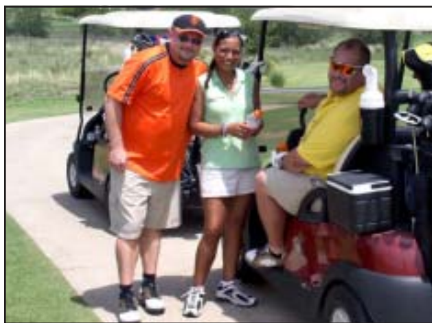
Success! This drink girl will do almost anything for a tip, even pose for a photo.